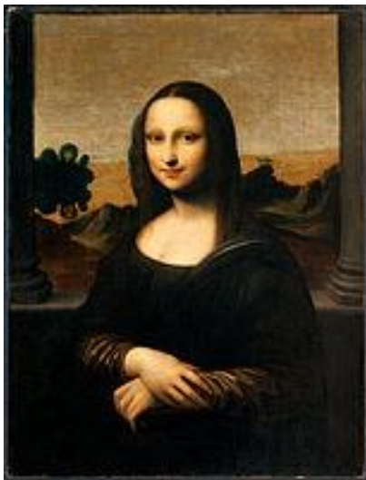
Mona Lisa by Michaelangelo