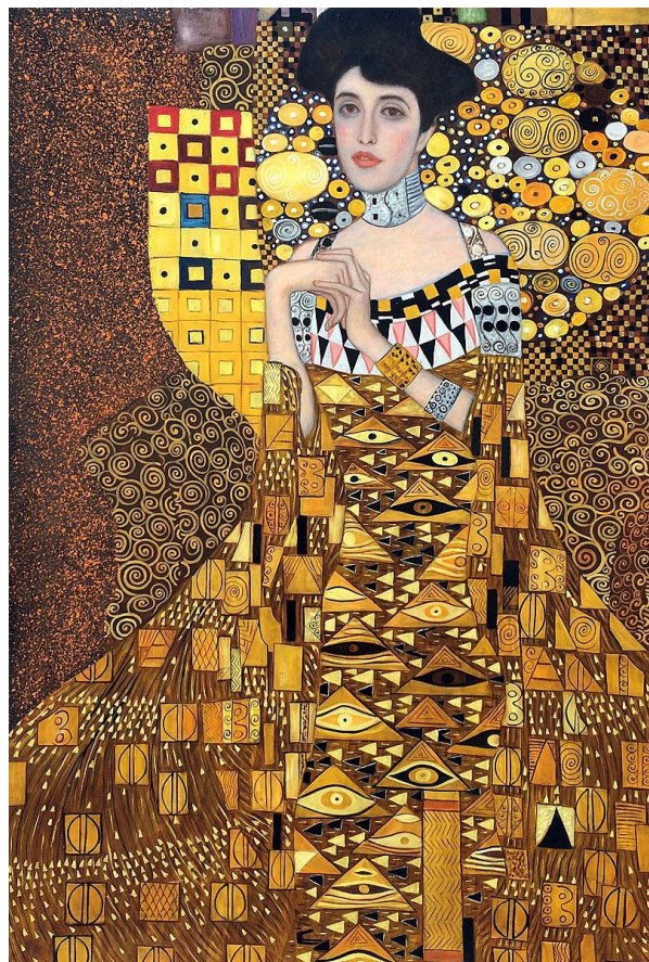
A portrait of Adele Bloch-Bauer 1